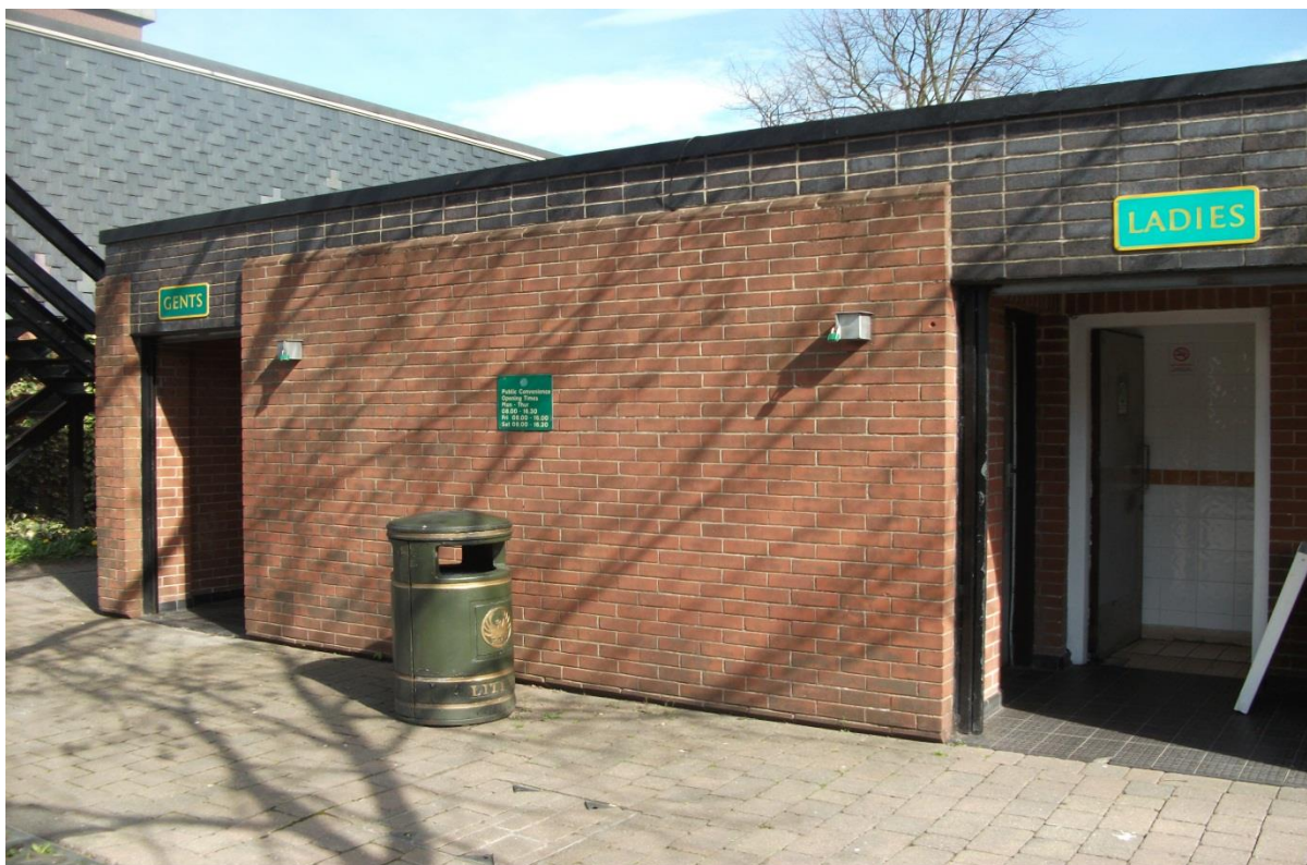
Male Toilets (top) Female Toilets (bottom)