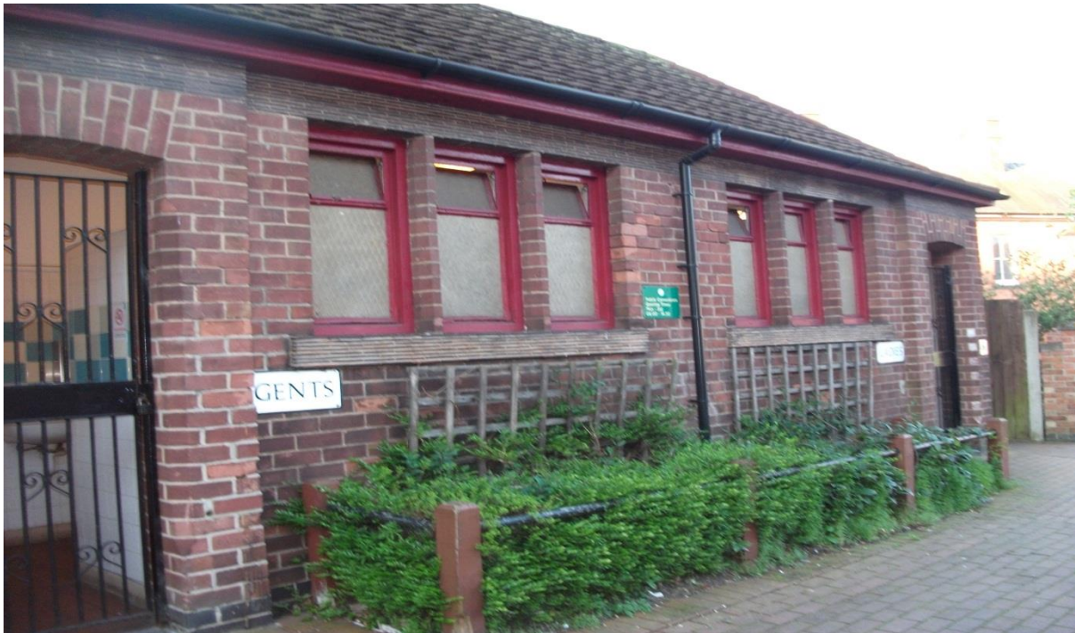
Male Toilets (top) Female Toilets (bottom)